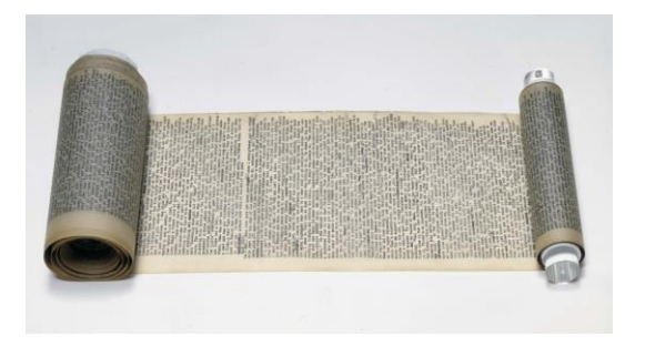
Fig. 6. Form Follows Function – reading is a long journey. The original of "On the Road" by Jack Kerouac in a 120–foot–long scroll, 1951