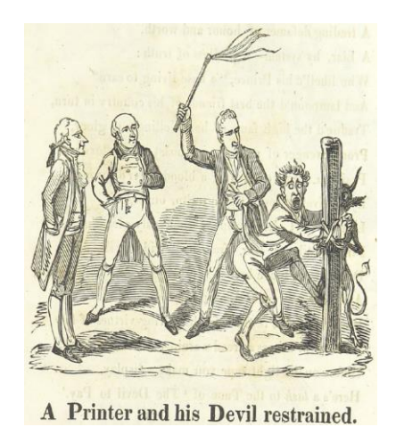
Fig. 5. A Printer and his Devil. The Men in the Moon: or, the Devil to pay, 1820, 25 (British Library, 2018c)

4) The principle of emancipation ("open format")