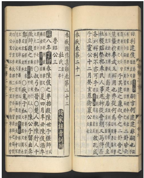
Fig. 1. The earliest printed book produced using metal type – Jikji , 1377, Korea (Seoul Printing Center, 2015; BNF, 2015)