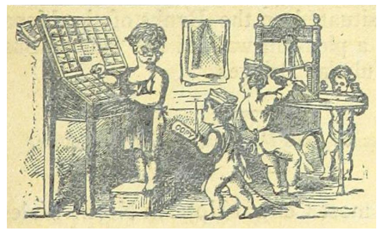
Fig. 4. A Printer and his Devil. Hartley's illustrated coaching guide to North Wales , 1889, 41 (British Library, 2018d)

This episode illustrates the thesis shared by M. McLuhan and U. Eco that fanatics and orthodox guardians of the status quo always fear innovation and do their best to ostracize it instead of generating motivation to develop both the old and the new (Fedorov and Kolesnichenko, 2013: 80–81). However, the story described by D. Defoe is extremely important due to the moral that can be derived from it and developed into a pattern . The resistance to recognise the contemporary electronic book as "a book" owing to its text instability and susceptibility to manipulation is fully justified from a psycho–analytic perspective as a natural human fear of "the deeds of the Devil" – a byword for "the sudden", "the unusual", "the inexplicable", and "the abnormal".