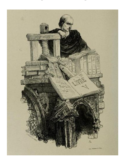
Fig. 3. "This will kill that." ("Ceci tuera cela."), i.e. the printed book will kill religion, the printing press will kill architecture. Illustration in the novel The Hunchback of Notre–Dame by Victor Hugo, 5th ed. (Lemud, 1889)

Bibles was condemned as a creation of the Devil so Gutenberg's partner was sent away being accused of "selling" black magic. (Defoe, 1727: 378; Johns, 2010: 8; Wahrman, 2012: 64)